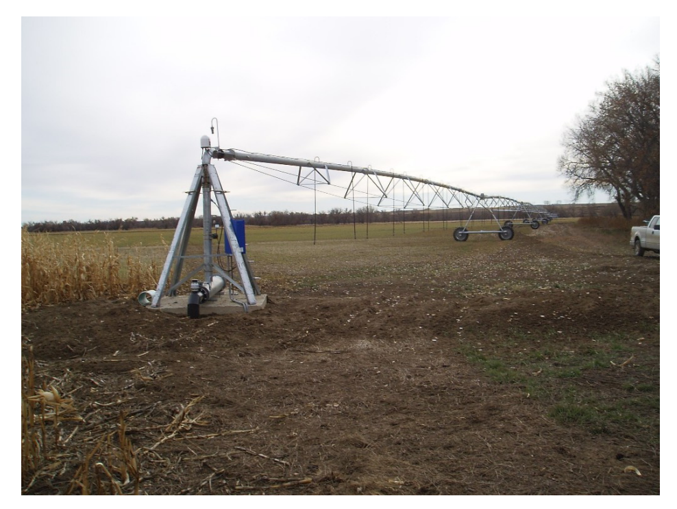
Figure 5. Irrigation System in the Belle Fourche Irrigation District Partially Funded With U.S. Environmental Protection Agency 319 Dollars.