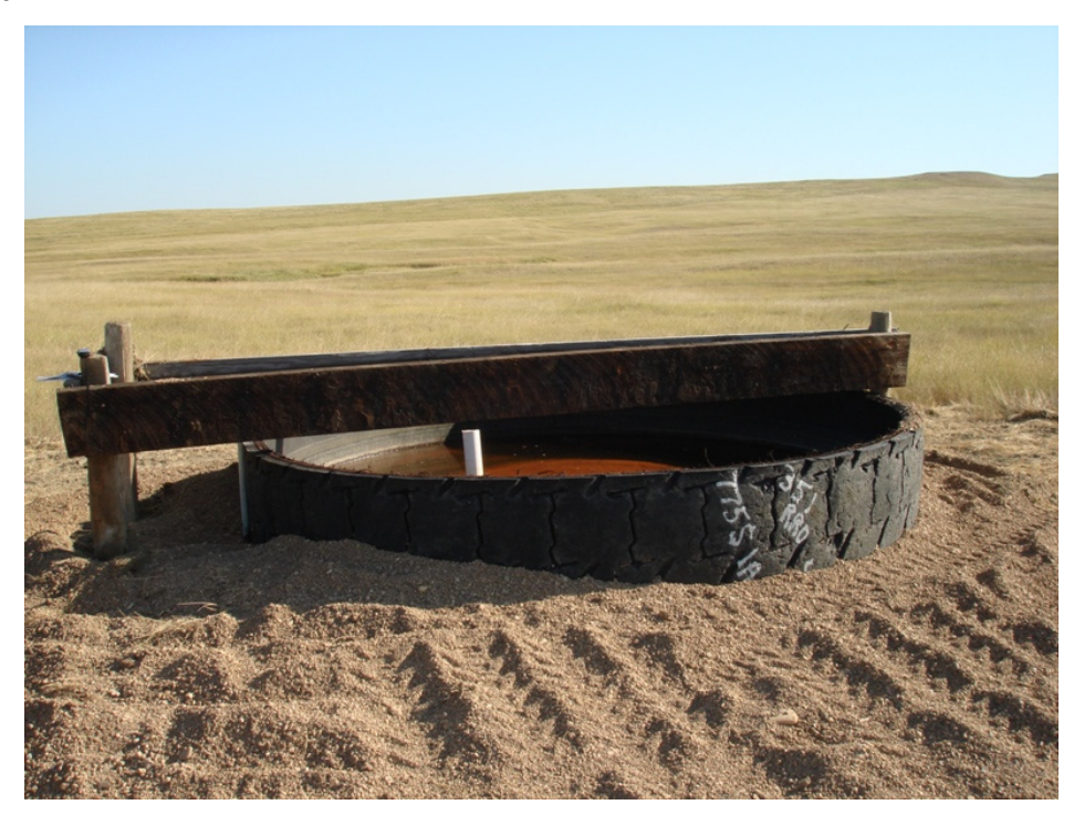
Figure 6. Livestock Water Development for Improved Grazing Funded by Belle Fourche River Watershed Partnership Cooperative Conservation Partnership Initiative Grant.