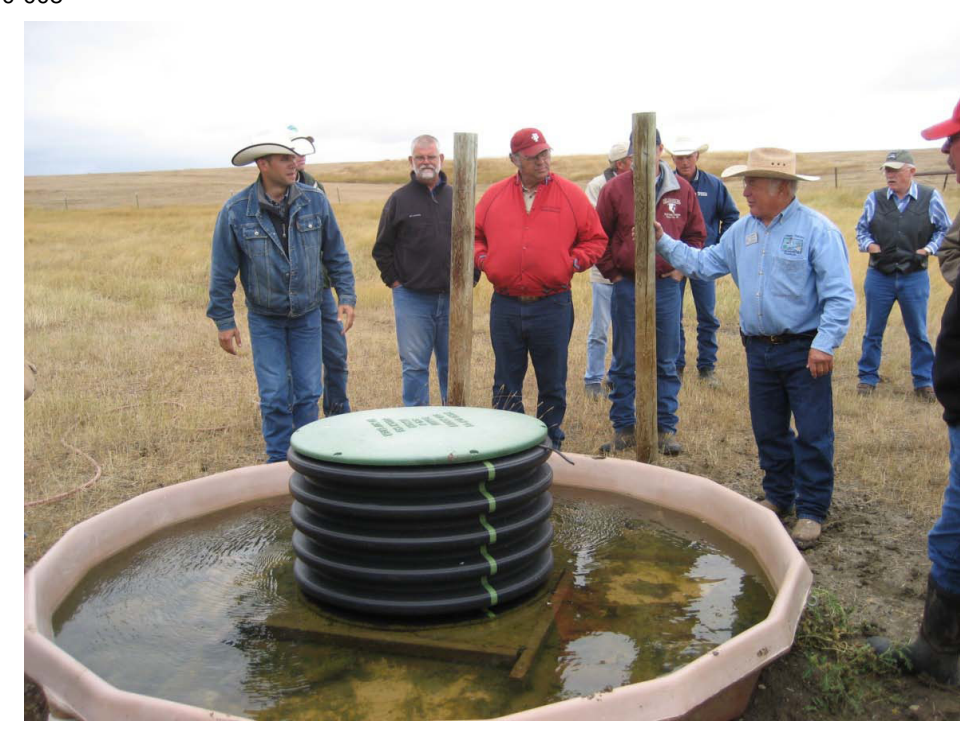
Figure 3. Demonstration of Off-Stream Water Development at the Elk Creek Conservation District Tour in September 2010.