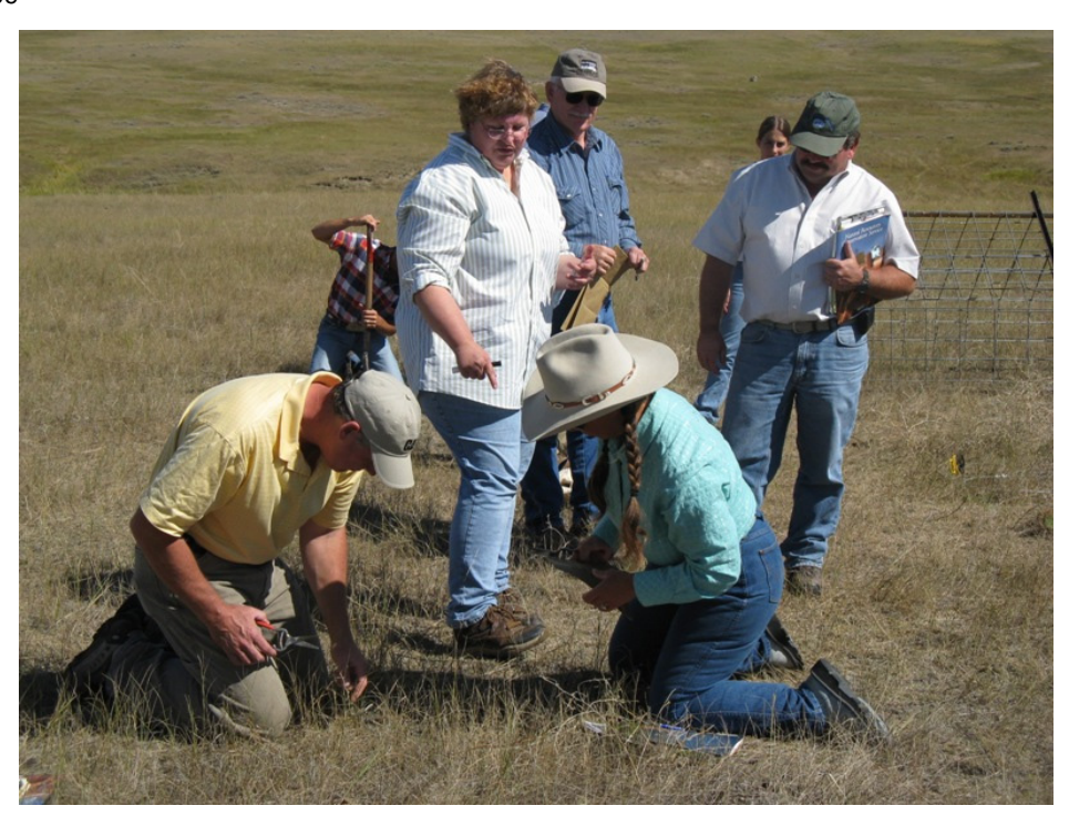
Figure 4. Producer Focused Range Monitoring School Sponsored by the Belle Fourche River Watershed Partnership and the Butte/Lawrence Natural Resources Conservation Service in September 2010.