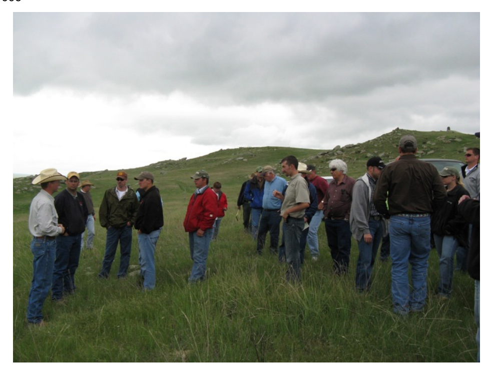
Figure 1. Agriculture Lenders Range Camp in June 2010. Tour is highlighting accomplishments of the Belle Frouche River Watershed.