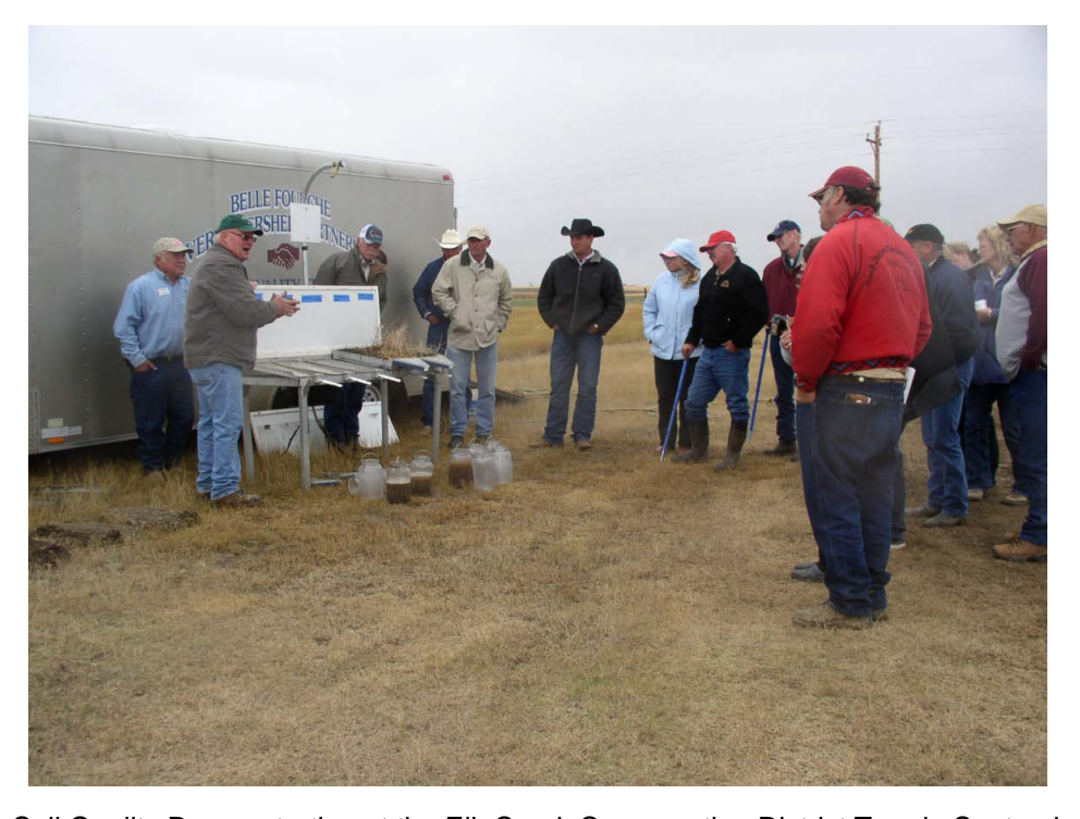
Figure 2. Soil Quality Demonstration at the Elk Creek Conservation District Tour in September 2010.